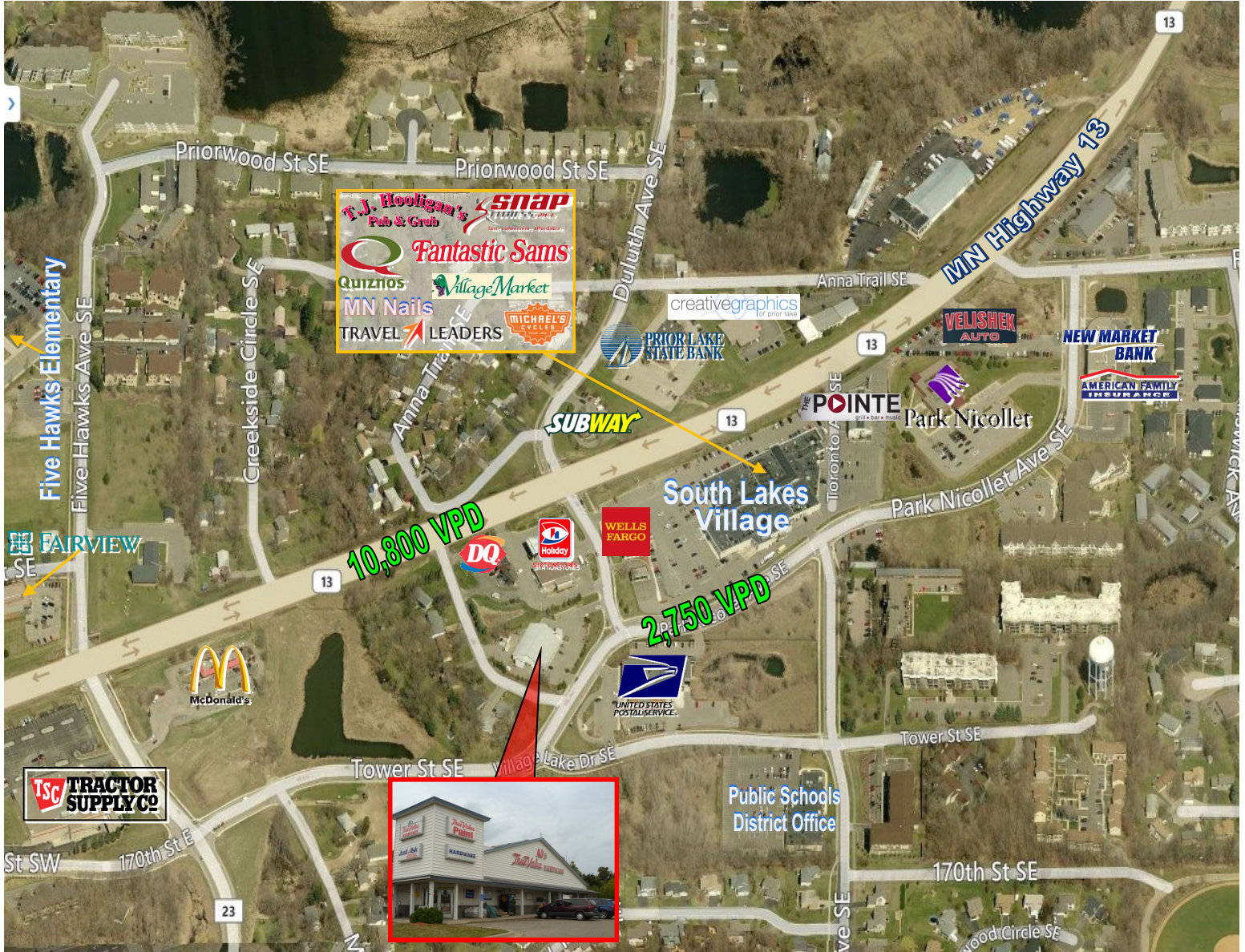
Prior Lake Hardware Store