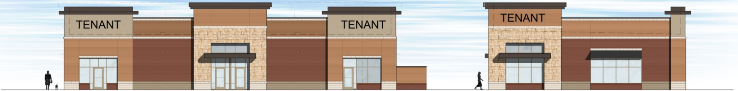
3 EAST ELEVATION FACING HISSON PLACE 1/8" = 1'-0"