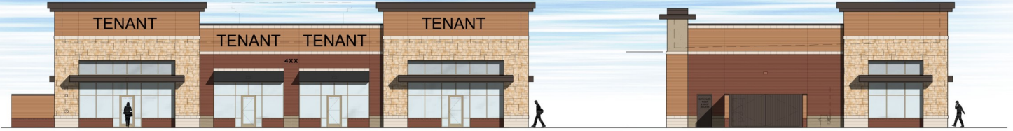
1 WEST ELEVATION FACING TARGET / PARKING 1/8" = 1'-0"