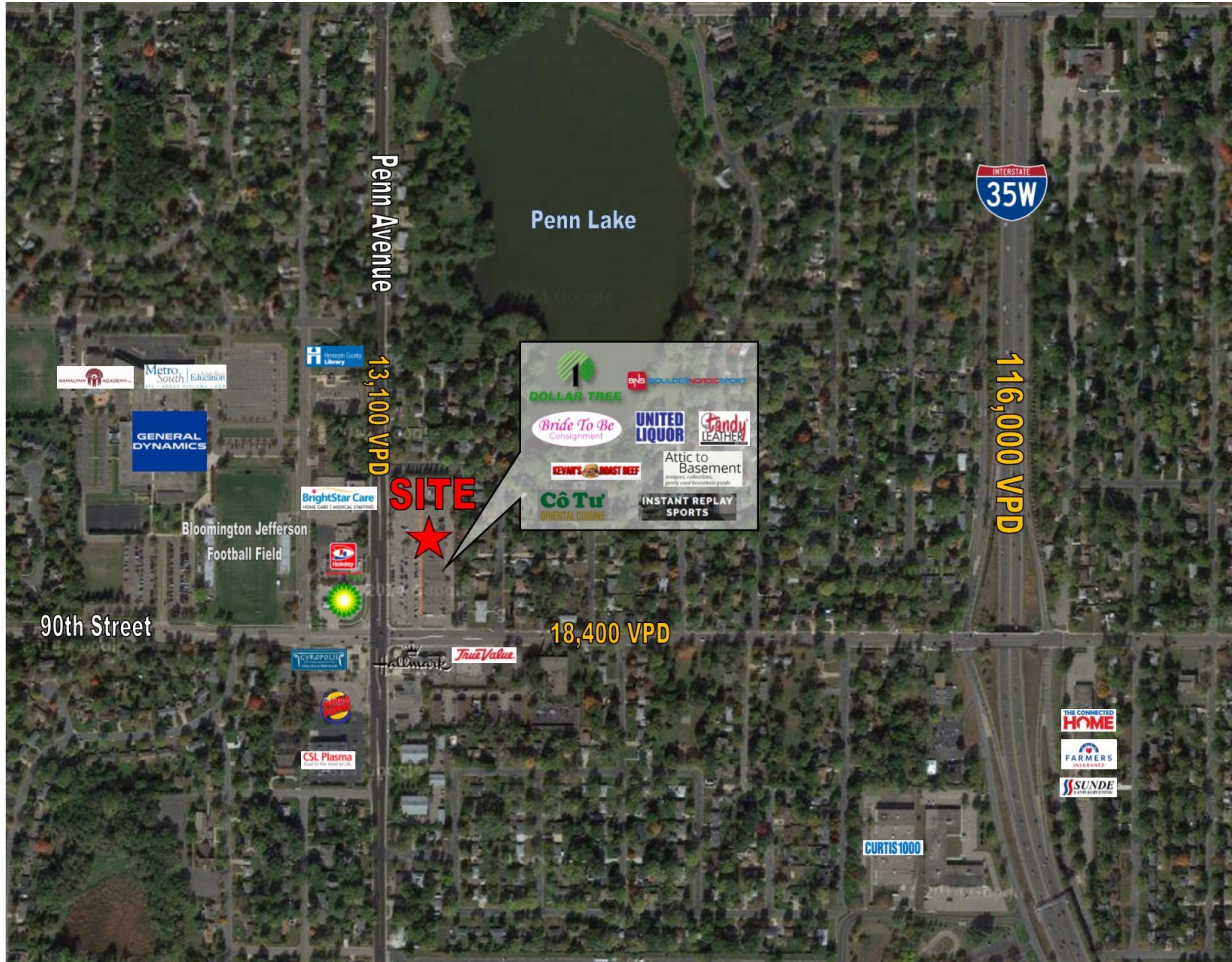
PennLake Shopping Center - Bloomington, MN