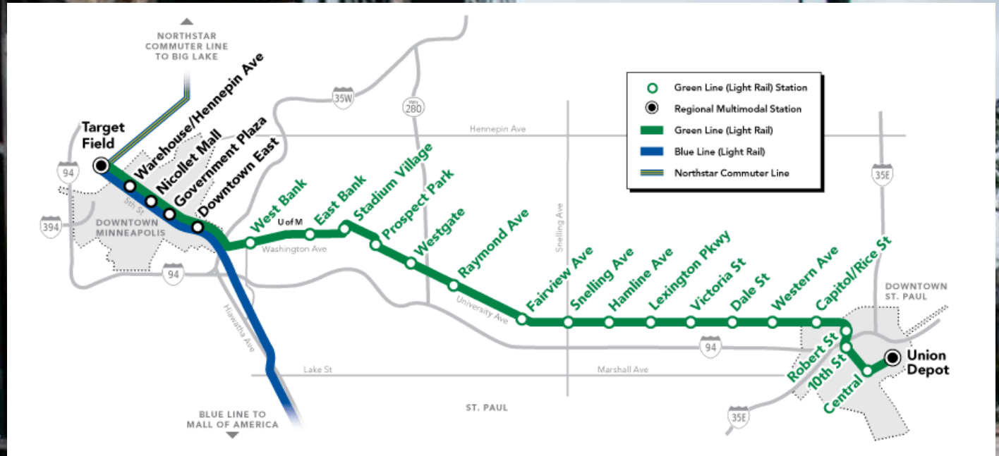
Metro Transit Light Rail Green Line Map Nice Ride Bicycle Station (Located near Fresh Thyme)