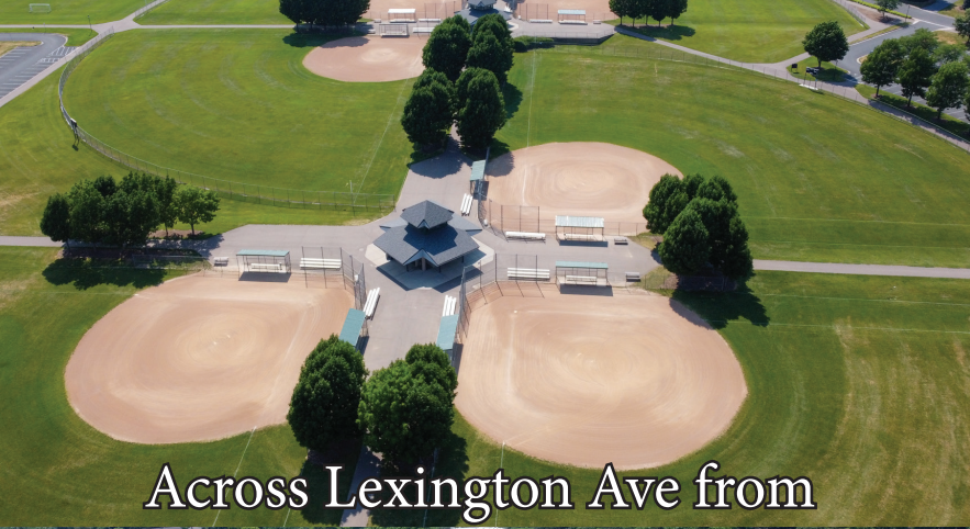
Across Lexington Ave from Lexington-Diffley Athletic Fields