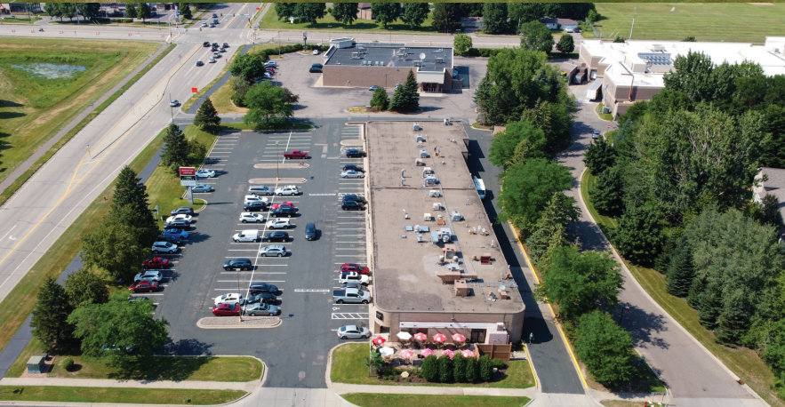
Next to Walgreens and Cub Foods