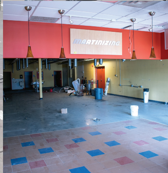
2,476 SF Space Interior