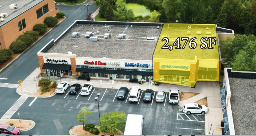
3525 Building Availabilities