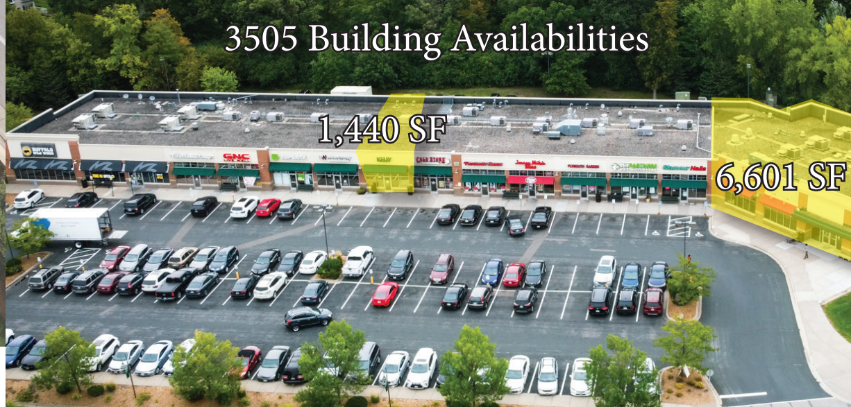
3505 Building Availabilities