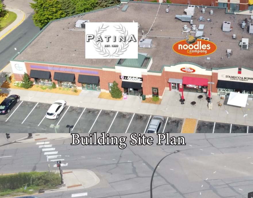
Building Site Plan