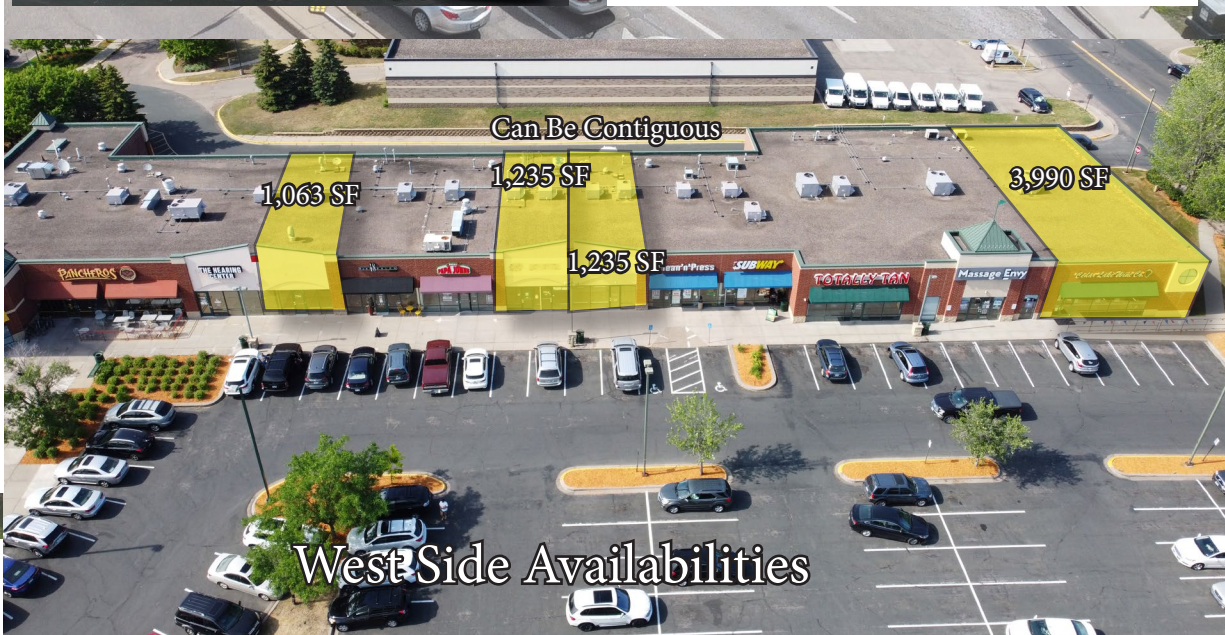
West Side Availabilities