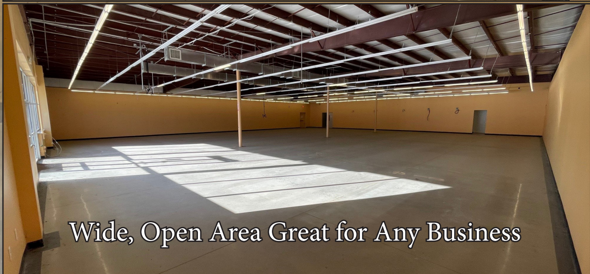
Wide, Open Area Great for Any Business