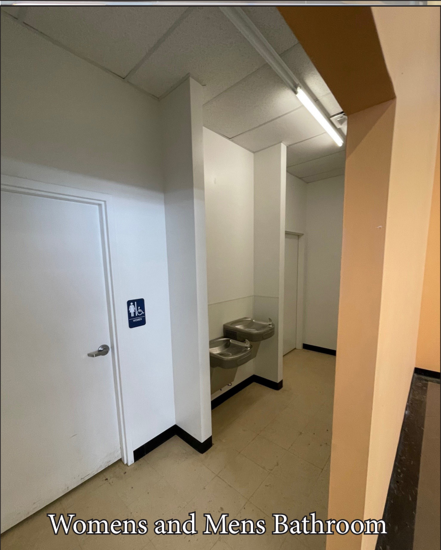
Womens and Mens Bathroom