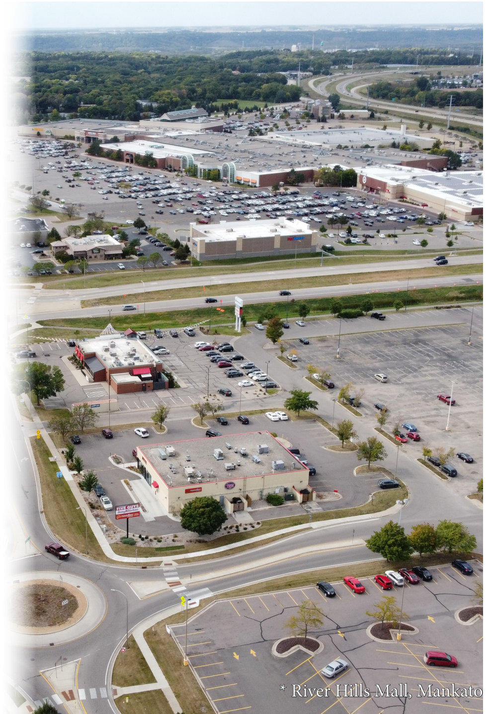
* River Hills Mall, Mankato

Current vacancy is higher than its trailing three-year average of 1.9%. However, this figure is lower than the national trailing three-year average of 4.2%. Rents have increased 7.5% over the past three years. Meanwhile, average rents increased 10.9% nationwide. There have been 62 sales over the past three years, amounting to $97.1 million in volume and 970,000 SF of inventory.